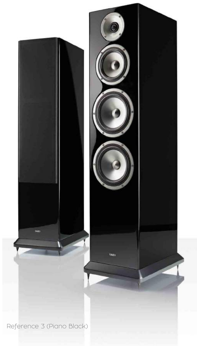
Reference 3 (Piano Black)

Encased in a range of premium cabinet finishes, the Reference Series 1 and 3 speakers are capable of meeting the most demanding of system expectations whilst offering exceptional performance and aesthetics, representing the pinnacle of Acoustic Energy speaker design.