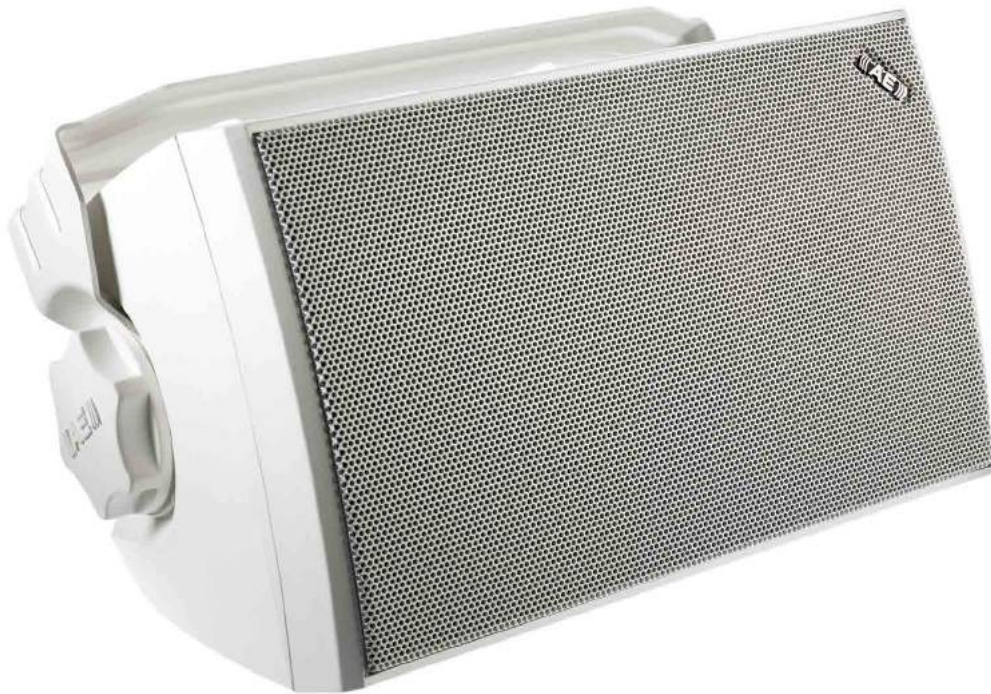
Extreme 5 Extreme 8

While they are very robust, the Extreme Series speakers are also a true Acoustic Energy product and perform as such. The Extreme 5 is ideal for use in gardens and high moisture environments but would be at home in a domestic audio system, while the larger Extreme 8 is powerful enough to be at home in demanding commercial environments too.