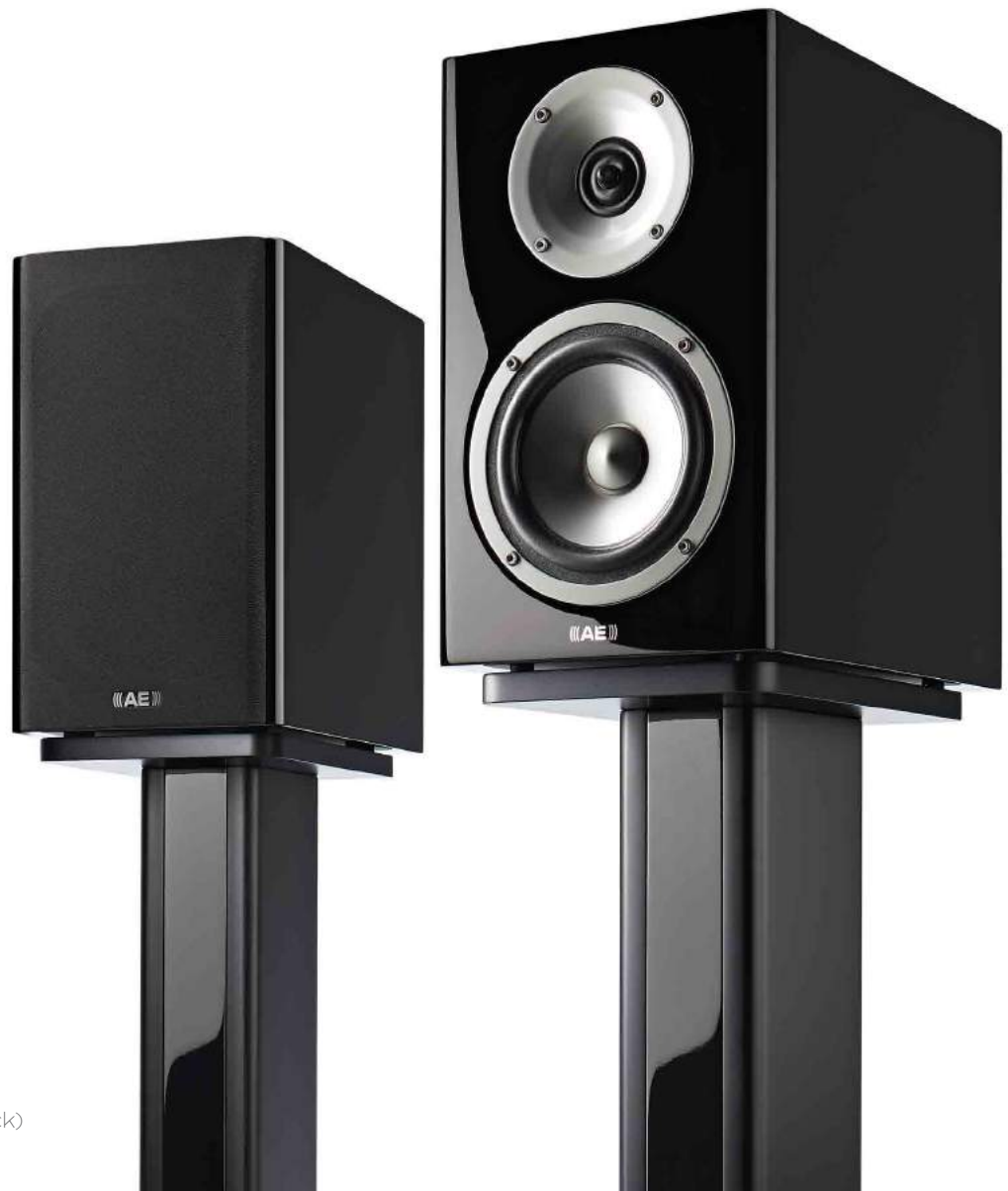
Reference 1 with Reference Stands (Piano Black)